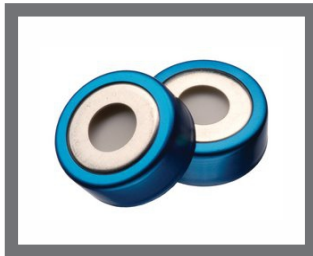
20 mm Magnetic GC Septa