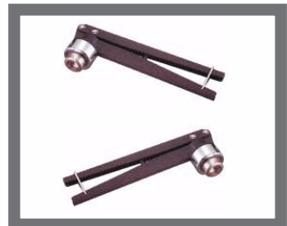
20 mm GC Crimper