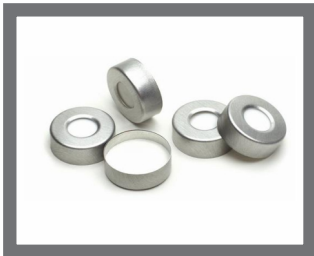
20 mm Aluminium GC Septa