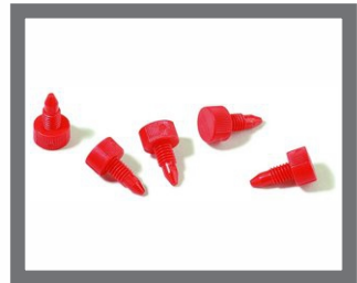
HPLC Column End Plugs